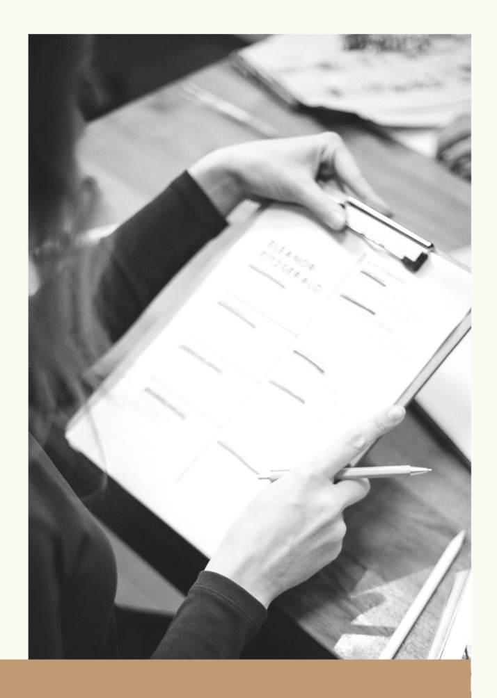
DEPLOYMENT SITES AND SCHEDULING LOGISTICS